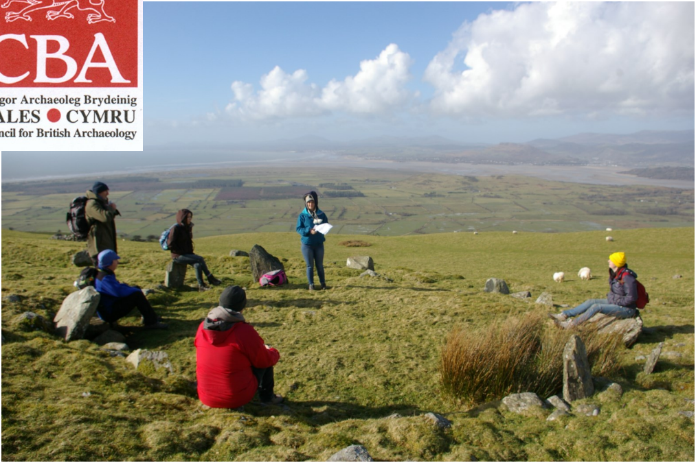
Moel Goedog, Ring Cairn, Gwynedd (PRN 1009)